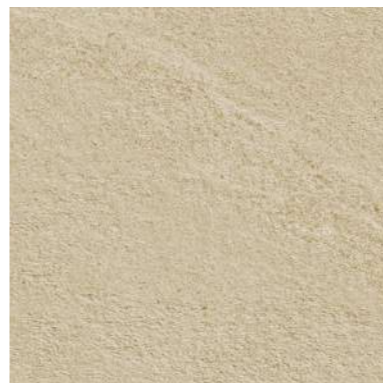
Beige PN600020 60x60 cm / 23.6x23.6"