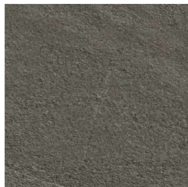
Anthracite PN600022 60x60 cm / 23.6x23.6"