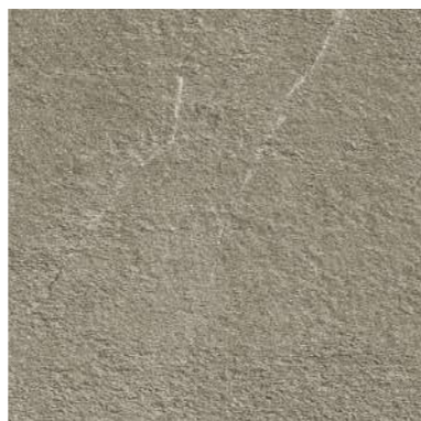
Oyster PN600021 60x60 cm / 23.6x23.6"