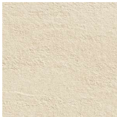
Ivory PN600019 60x60 cm / 23.6x23.6"