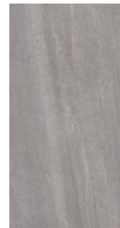
Dark Grey 612032