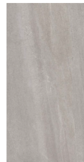
Light Grey 612031