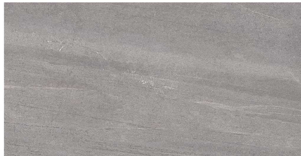
Dark Grey 612032 60x120 cm / 23.6x47.2"