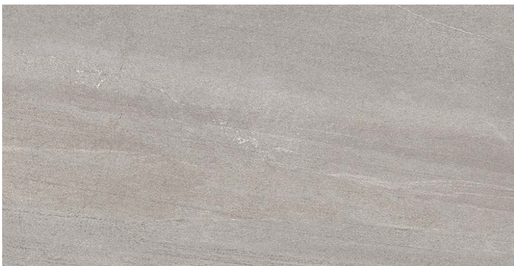
Light Grey 612031 60x120 cm / 23.6x47.2"