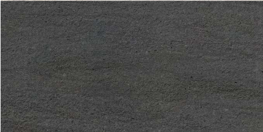
Dark Grey Y631435 30x60 cm / 11.8x23.6"