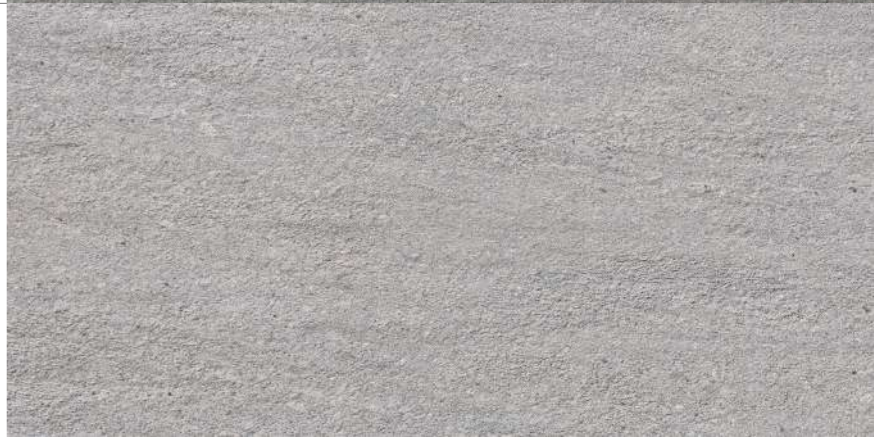
Light Grey SD63003 30x60 cm / 11.8x23.6"