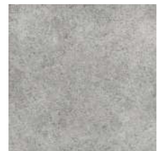
Light Grey 604186 / 604186H