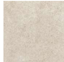
Beige 604185 / 604185H