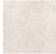
Ivory 604184 / 604184H