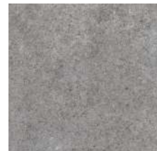
Grey 604187 / 604187H