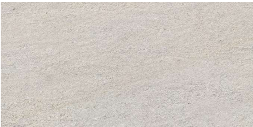
Ivory Y631433 30x60 cm / 11.8x23.6"