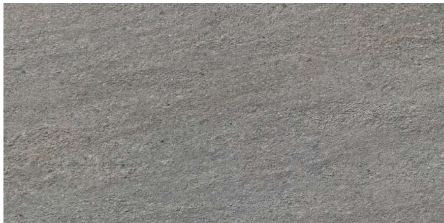
Grey SD63005 30x60 cm / 11.8x23.6"