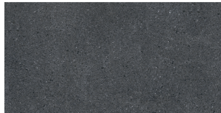
HT12F125K / HT6F125K Dark Grey