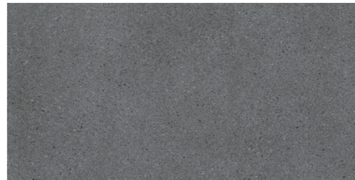
HT12F123K / HT6F123K Charcoal