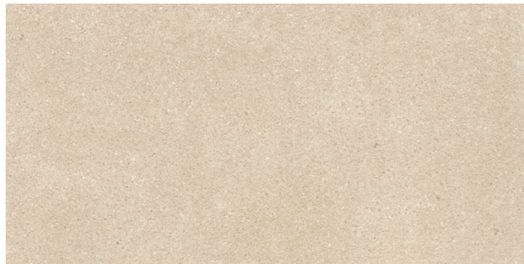
HT12F121K / HT6F121K Beige