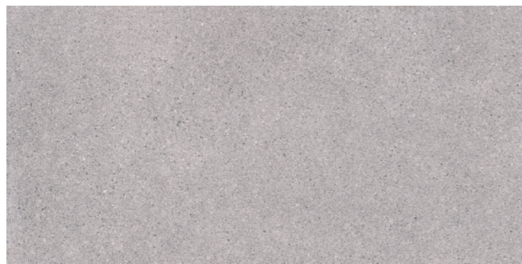
HT12F122K / HT6F122K Light Grey